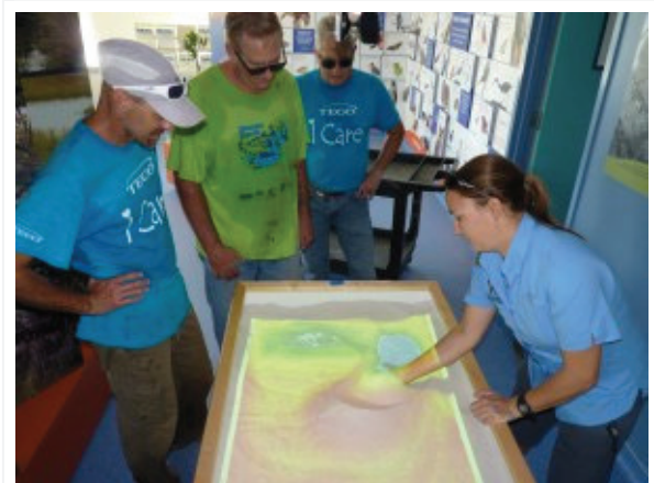
Among the many cool interactive exhibits you can see at the SYCC open house, this one lets visitors simulate how varying amounts of rainfall affect a habitat. TECO team members, fresh from work to add native plants to nearby Newman Branch Creek, got a sneak peek at the SYCC late last year.

FCTC, rising now in Apollo Beach, is a cooperative effort between the Florida Fish and Wildlife Conservation Commission (FWC) , The Florida Aquarium and Tampa Electric – whose world-famous Manatee Viewing Center is itself growing right next door.